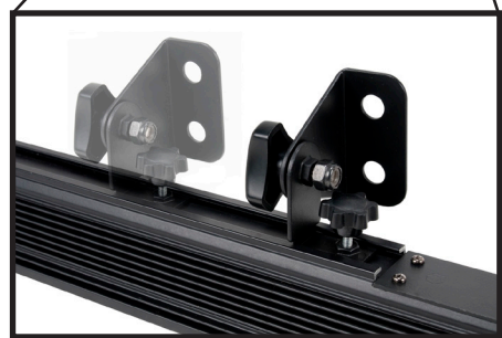
Adjustable Mounting Bracket

SAFETY CABLE ALWAYS ATTACH A SAFETY CABLE WHENEVER INSTALLING THIS FIXTURE IN A SUSPENDED ENVIRONMENT TO ENSURE THE FIXTURE WILL NOT FALL IF THE CLAMP FAILS.